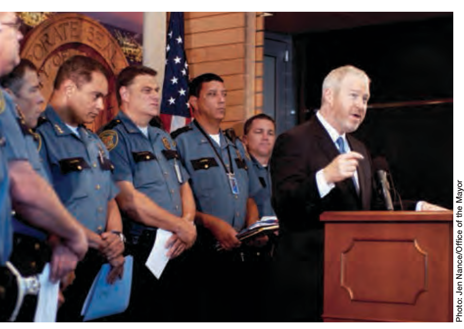
Mayor Michael McGinn with Seattle Police Commanders

include the community's appreciation for the interconnectedness of issues, its knack for forming collaborative coalitions, and its willingness to support efforts for the greater good, such as levies for schools and housing. Seattle's mature infrastructure of District Councils, vibrant community organizations, and well-established nonprofit organizations offer many avenues for civic participation.