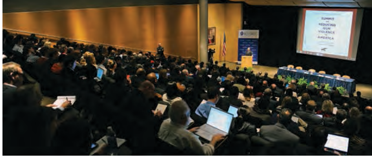
Researchers at Johns Hopkins Gun Policy Summit spoke to a packed audience in January.