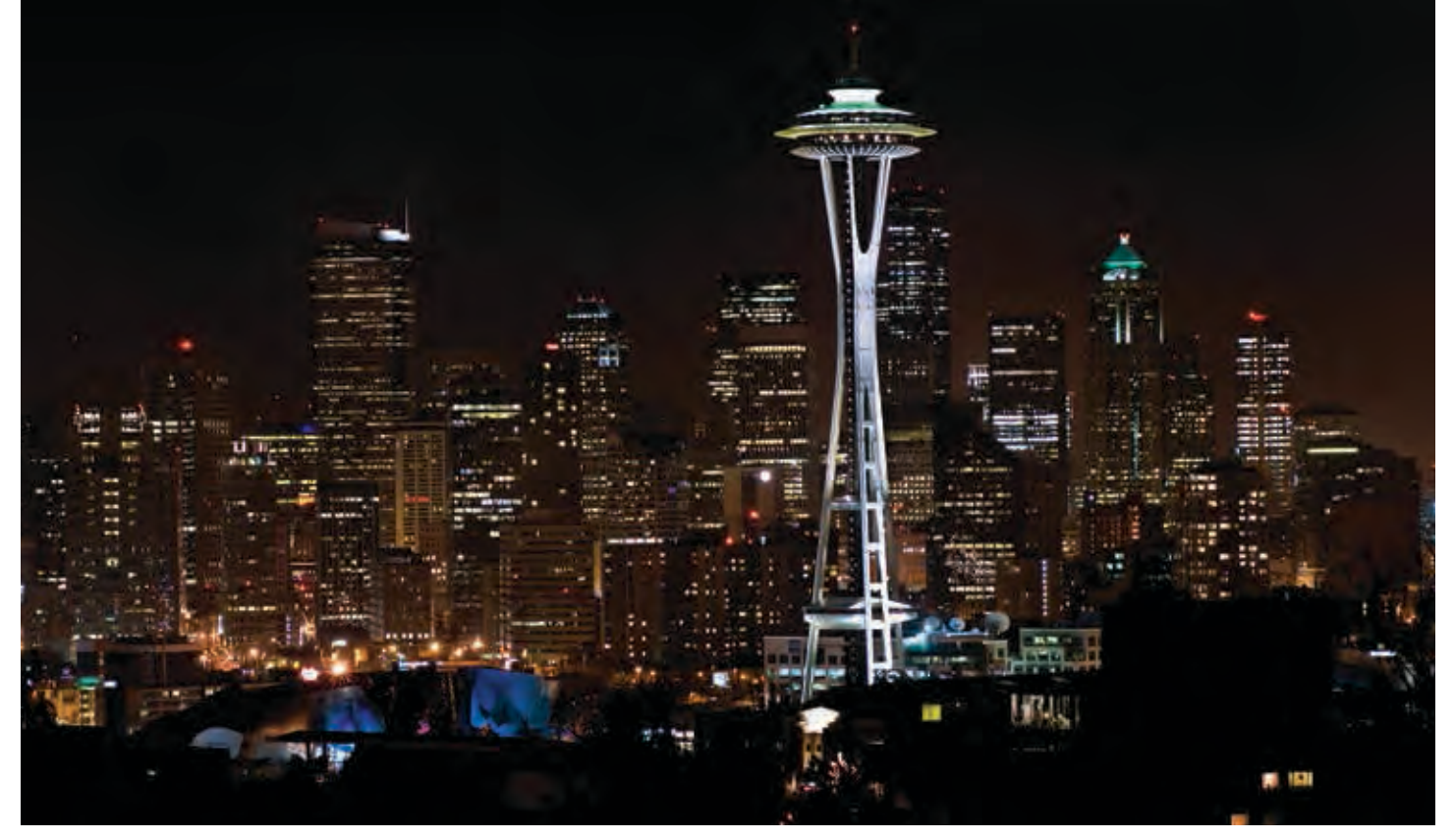
Seattle at night

more value from the golden uncommitted time during patrol will allow us to emphasize even more a place-based approach to fighting crime and fear.