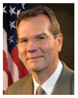
John H. Laub

Another goal of translational criminology is to address the gaps between scientific discovery, program delivery, and effective crime policy. This is the knowledge application process, or T2 in translational medicine—enhancing access to and the adoption of evidence-based strategies in clinical and community practice (obssr.od.nih.gov/scientific_areas/translation/index.aspx).