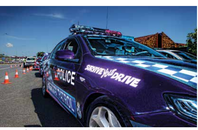
Queensland Police conducting random breath testing

The RCT results showed significant differences between the experimental and control groups on all key outcome measures. Drivers who received the experimental RBT encounter were 1.24 times more likely than the control group to report that their views on drinking and driving had changed. Moreover, experimental respondents reported higher levels of compliance and satisfaction with police during the encounter than did their control group counterparts. The results show that the way citizens perceive the police can be influenced by the way in which police interact with citizens during routine encounters and demonstrate the positive benefits of police using the principles of procedural justice.