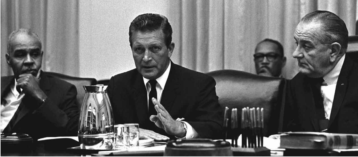
Roy Wilkins, Governor Otto Kerner (chairman), and President Lyndon B. Johnson.